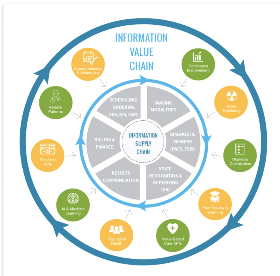
Figure 2: Information Supply and Value Chain